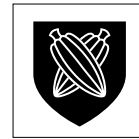
BELGIAN CHOCOLATE SCHOOL

SMALLANDLAAN 4 UNIT 2 • 2660 HOBOKEN, ANTWERPEN • BELGIUM